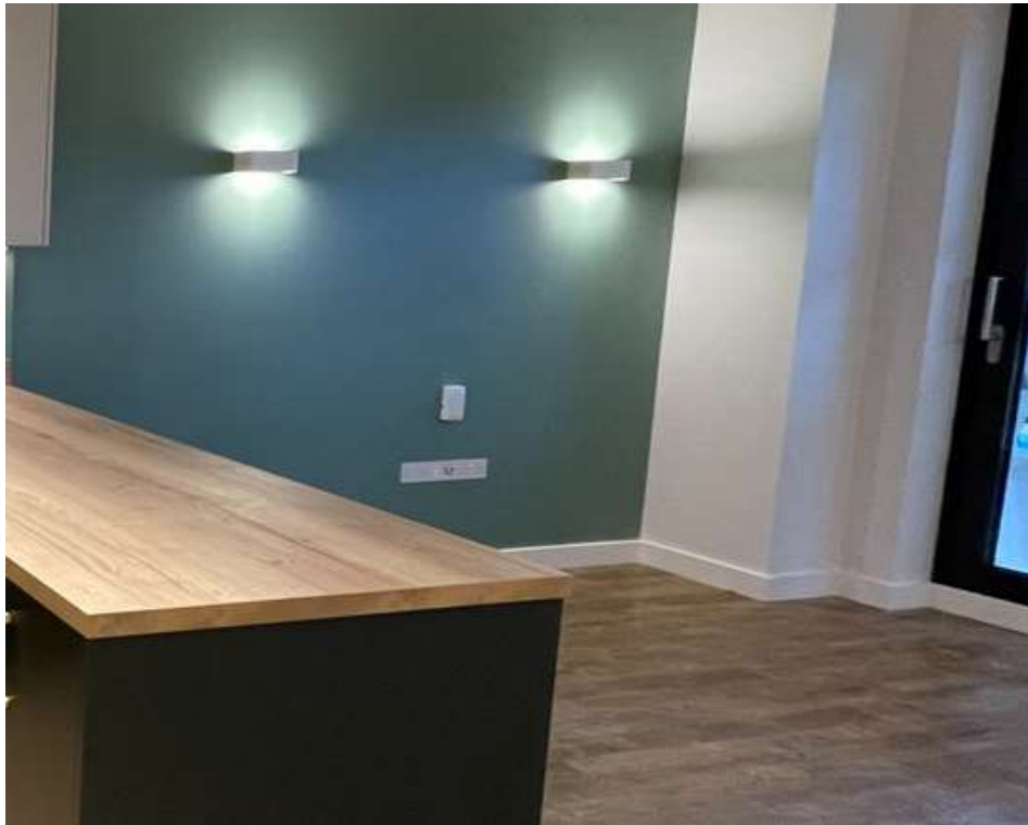
Figure 1.1A - A wall-mounted Ruckus ZoneFlex H510 Wi-Fi Point above the TV/Radio outlets.