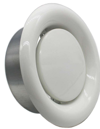
Figure 1.1A - An Extract Valve Make: Waterloo - Model: VB/125

Extraction takes place via ceiling mounted valves within the utility cupboard, kitchen and bathroom areas. Extract valves are set in place during the commissioning process and must not be adjusted.