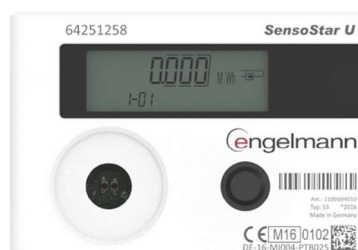
The SensoStar U Heat Meter