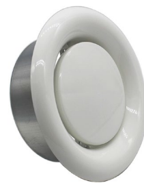
Figure 2.1B - An Extract Valve Make: Waterloo - Model: VB/125