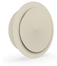
Figure 2.3A - A Supply Air Valve Make: Waterloo - Model: VA/125

Fresh air is supplied through an external inlet, which is ducted to ceiling mounted supply valves around the home. These valves, which are similar in appearance to the extract models, are located within all rooms. The fresh air inlet is not connected to the MEV unit and operates by entirely natural means.