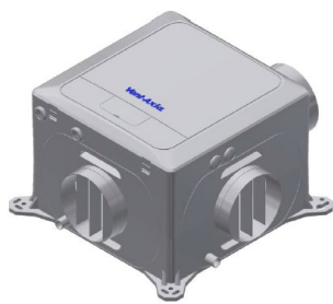
Figure 2.1A - The MEV Unit Make: Vent Axia - Model: MVDC-MS(H)

Extract valves are set in place during the commissioning process and must not be adjusted.